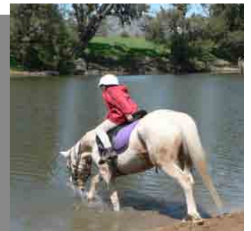
...a hard days work deserves...