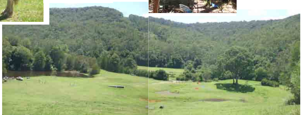
The view of the Valley from the top of the Golf Course Hill. Not bad!