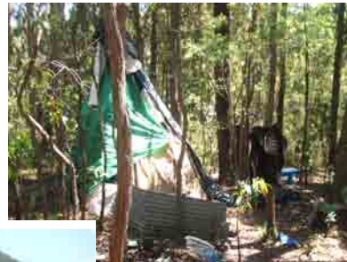
The Teepee. .... No place like home?